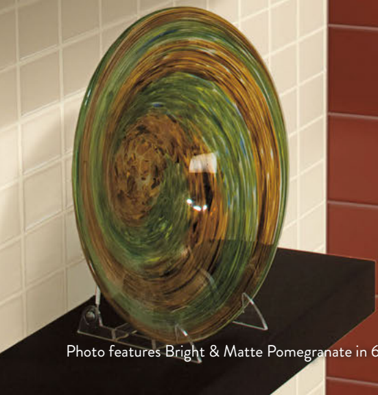
Photo features Bright & Matte Pomegranate in 6 x 6 and Satinbrites/Satinglo Almond in 2 x 2 on the wall.