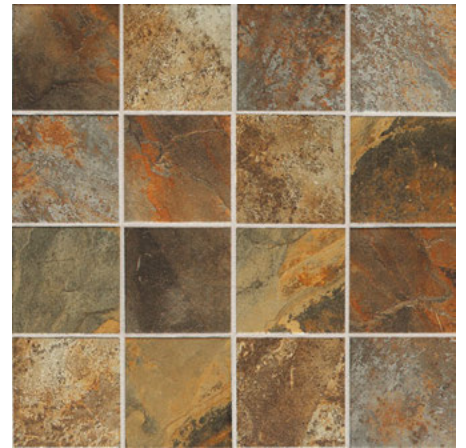
CARLISLE BLACK KS03