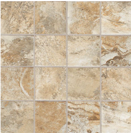
AMBLESIDE BEIGE KS01