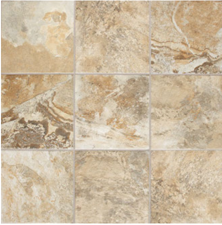
AMBLESIDE BEIGE KS01