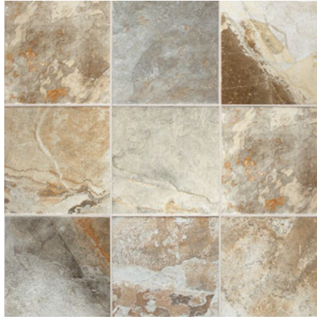
EASDALE NEUTRAL KS02