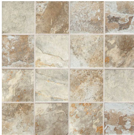
EASDALE NEUTRAL KS02