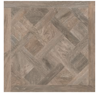
Greige Decor 32x32