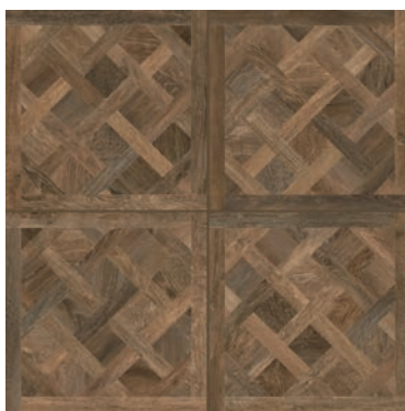
Chestnut Decor 32x32 Range