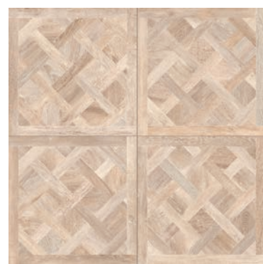
Blonde Decor 32x32 Range