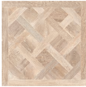
Blonde Decor 32x32