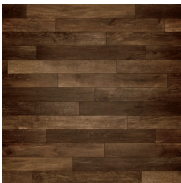
Chestnut 6x48 Range