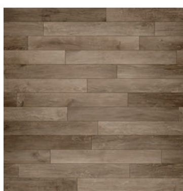
Greige 6x48 Range