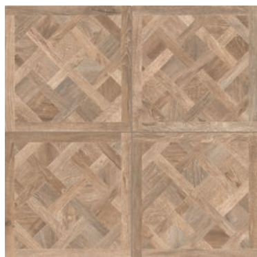
Amber Decor 32x32 Range