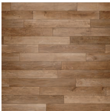
Amber 6x48 Range