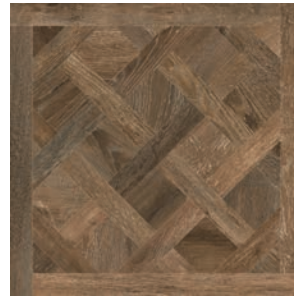
Chestnut Decor 32x32