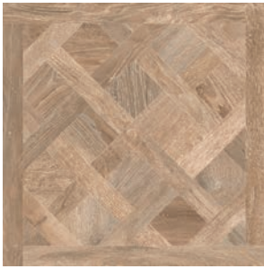
Amber Decor 32x32