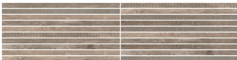
Greige Blend 2x48 Range