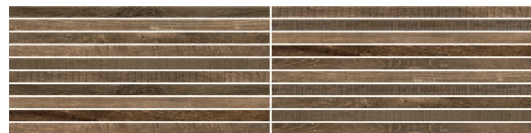
Chestnut Blend 2x48 Range