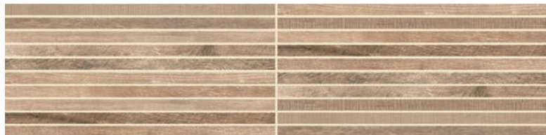
Amber Blend 2x48 Range