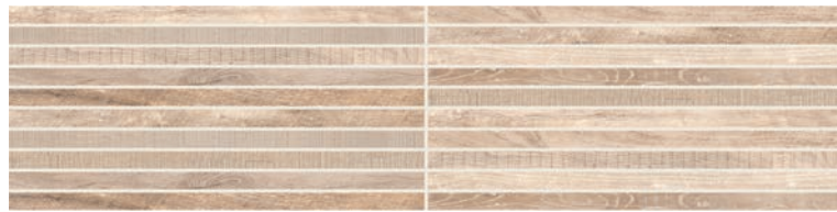
Blonde Blend 2x48 Range