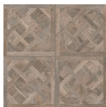
Greige Decor 32x32 Range