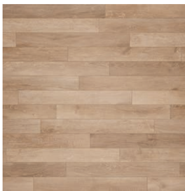
Blonde 6x48 Range