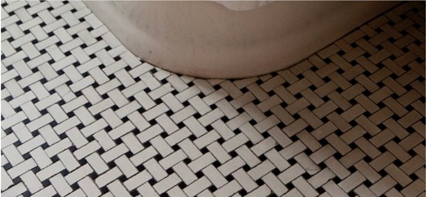
Black & White Basketweave